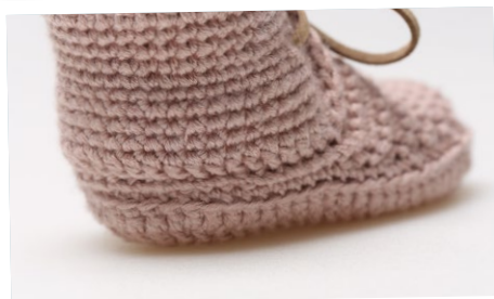
Heel Cap sewn onto the Sole.