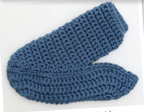
The finished Top Piece on the Sole.