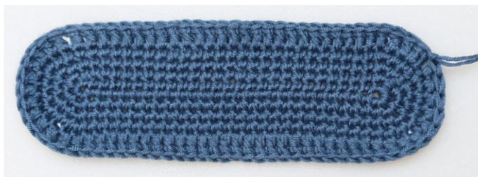
Finished Heel Cap.