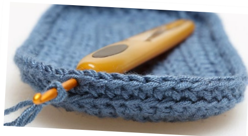
Start here on the Top Piece.