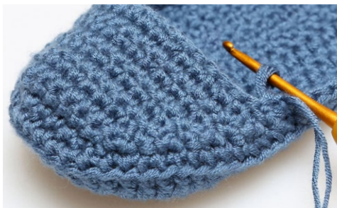
Start here on the 10th row of the Top Piece.