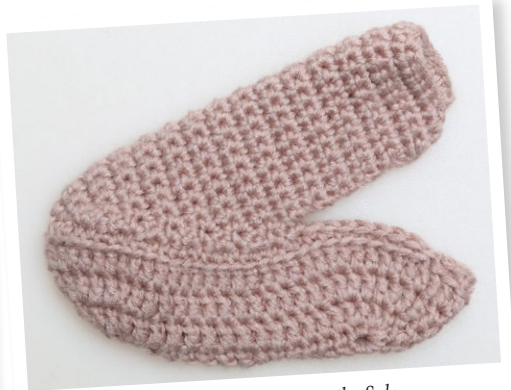
The finished top piece on the Sole.