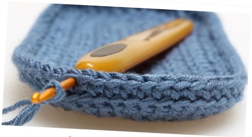
Start here on the Top Piece.