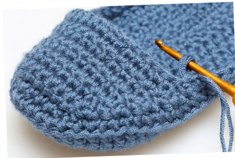
Start here on the 10th row of the Top Piece.