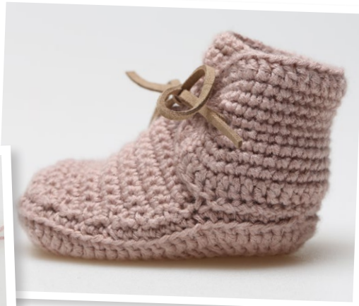
Finished Heel Cap.